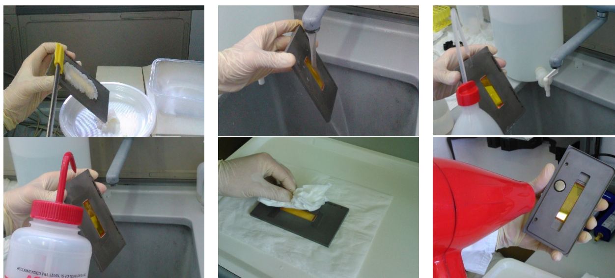
Figure 2. HATR crystal cleaning procedure

After recording the spectrum, the sample is removed by the crystal with a scraper/spatula. The crystal is then cleaned with drinking water, deionised water, rinsed with acetone, and dried by using a lens cleaning tissue and a gentle cold air stream (see Figure 2).